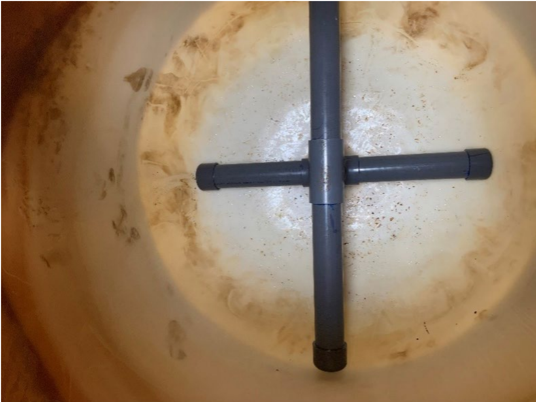
Replacement hub and lateral.

Stainless steel laterals can be installed instead of the plastic ones for increased strength; however, the issue of complete removal remains if the laterals extend across the full bottom of the vessel.